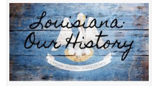
Louisiana Our History

Louisiana Genealogical and Historical Society, established 1953